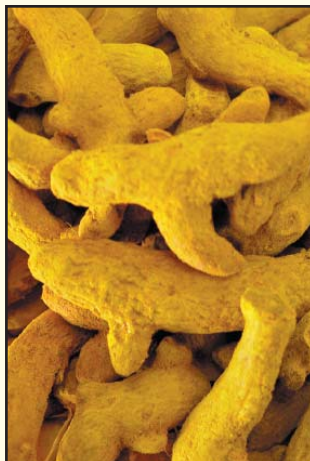
Freshly harvested grade 10 turmeric roots from the central forests of India

biles are necessary for proper digestion as it alkalizes stomach acids and helps formation of chyme.