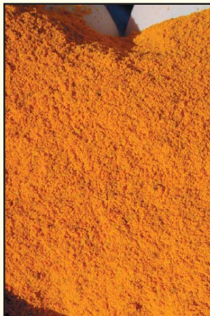
FRESH-GROUND, GRADE 10 TURMERIC POWDER READY FOR ENCAPSULATION