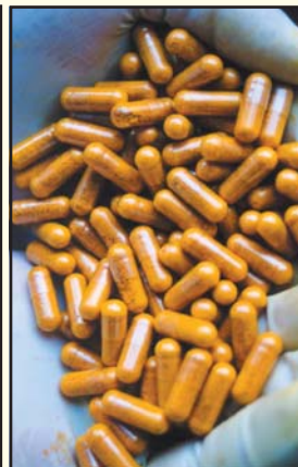
Fresh-ground, grade 10 turmeric encapsulated in 100% natural vegetable capsules

Only the finest grade 10 quality Indian turmeric is ground in Premier Research Lab's non-toxic grinder and then immediately encapsulated in 100% vegetable capsules without any toxic excipients whatsoever. No magnesium stearate (a hydrogenated oil), talcum or silicon dioxide (ground sand) are used. Quantum Turmeric and all raw materials used by Pre-