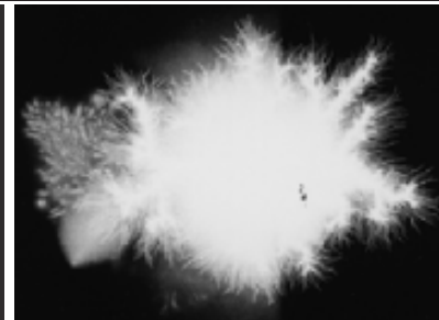
Kirlian photograph of a 100% pure vegetable capsule multivitamin from a living source. Note the significant Body of Light.