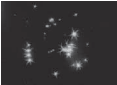
Kirlian photograph of a tablet of one of the largest-selling "Natural" Multivitamins (USP) in the world. The energy pattern looks weak and lifeless.