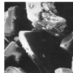
Isolated Ascorbic Acid USP Vitamin C

Photographs from Electron Microscope (both taken at same magnification)